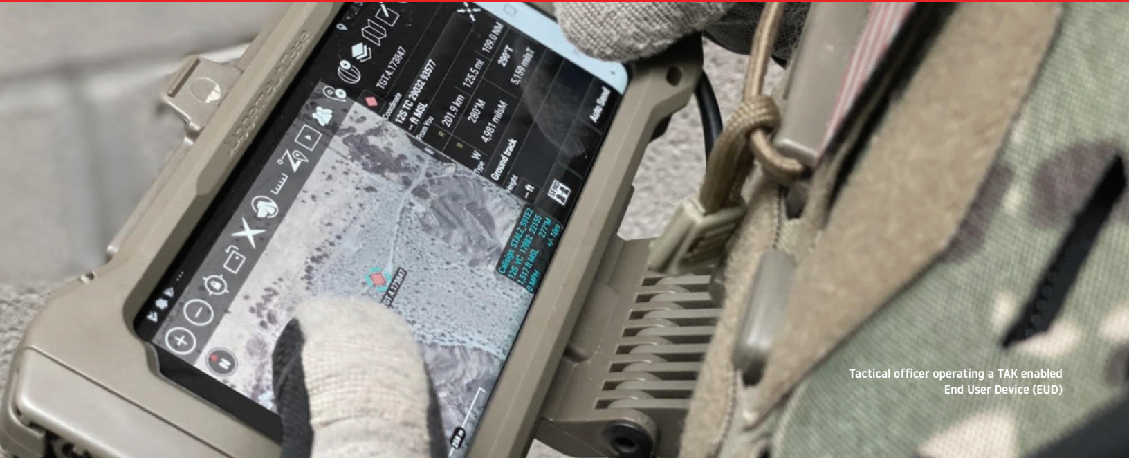
Tactical officer operating a TAK enabled End User Device (EUD)