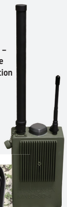
PhantomX – Expendable Configuration