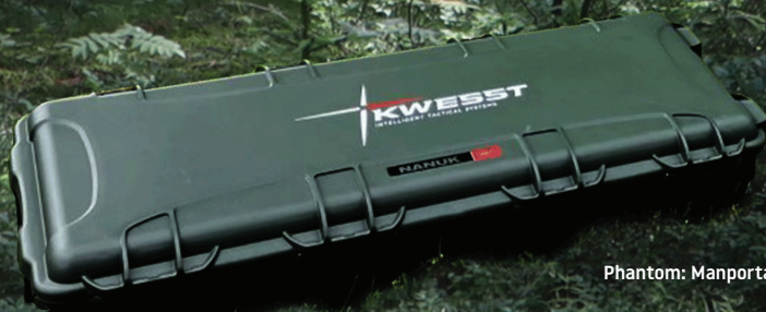
Phantom: Manportable Configuration