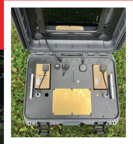
The KWESST Phantom™ Tactical Multi-Function Electro-Magnetic Spectrum Operations (EMSO) System consists of two configurations: